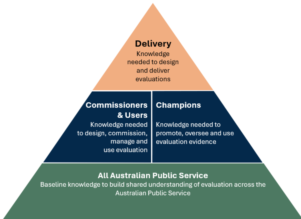
Table 1: Evaluation knowledge pyramid: knowledge needs for different audiences